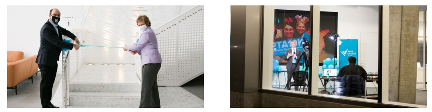
Founder's Day Weekend: APTA celebrated its beginnings with virtual events the weekend of Jan. 15, including the ribbon cutting to officially open APTA Centennial Center, and APTA's Founder's Day Celebration with interviews and videos from association and component leaders.

APTA's centennial in 2021 was about more than our history. We honored achievements and the possibilities for the profession's next century. In a year of continued challenges due to the COVID-19 pandemic, APTA's centennial provided a welcome opportunity for embracing the power of togetherness. We felt extra pride in what the APTA community has accomplished — and where we're headed, together.