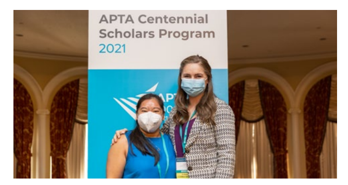
The APTA Centennial Scholars program helped to build a cadre of future association leaders at the national and component levels, supporting our collective quest for a diverse and prepared leadership pool.