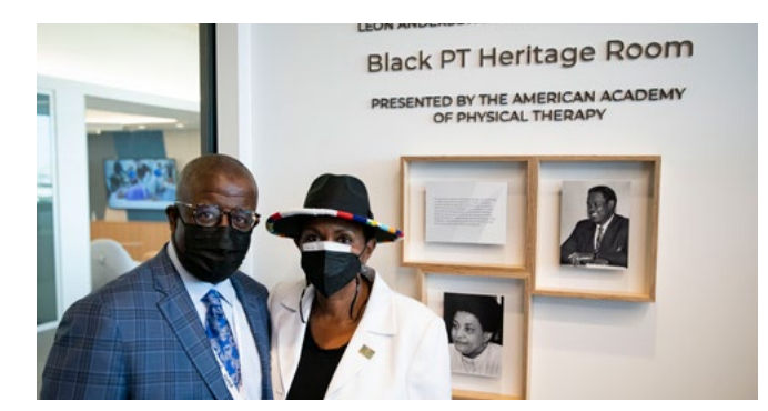
During APTA's Open House, we held multiple room dedication ceremonies, honoring individuals who've made tremendous contributions to our profession and our association.