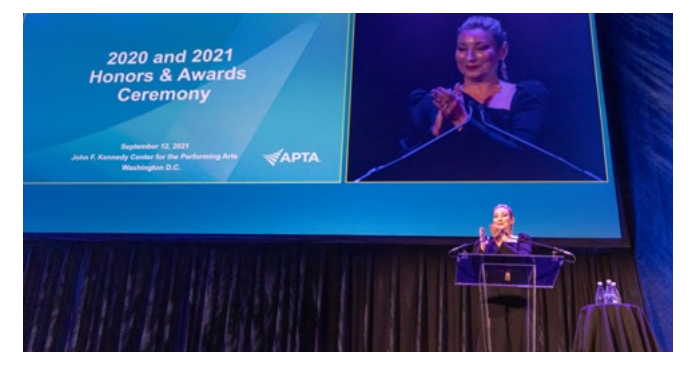
APTA recognized outstanding achievements by our members during the 2020 and 2021 Honors & Awards Ceremony at the Kennedy Center for the Performing Arts on Sept. 12.