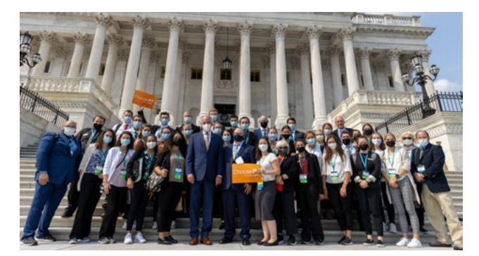
APTA's centennial celebration included an advocacy day in Washington, D.C., on Sept. 14. More than 450 PTs, PTAs, students, and supporters turned out to receive advocacy training and then attend scheduled meetings with their representatives and staff, some virtual and others in person.