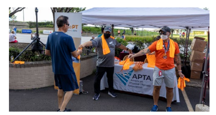
APTA was the grand sponsor of the 20th annual Arlington Police, Fire, Sheriff and ECC 9/11 Memorial 5K Race, held Sept. 11. We connected with the local community, handing out ChoosePT cooling towels, shoelaces, pins, stickers, and educational information.