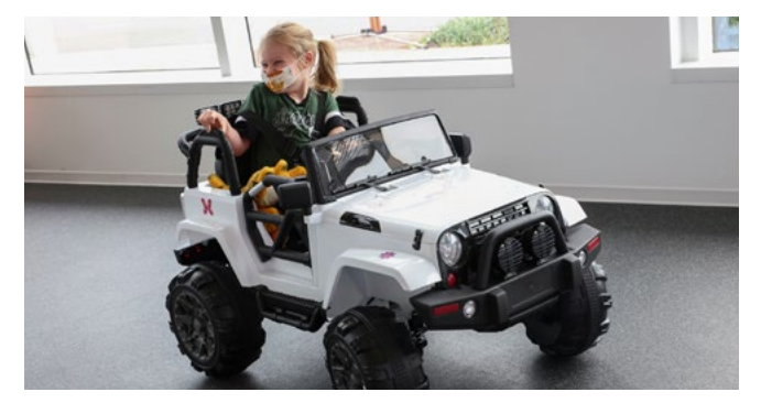
On Sept. 22, APTA launched an effort to make a collective impact on our communities during the last 100 days of our centennial year. We collaborated with Special Olympics, Go Baby Go, and Move Together to create toolkits that could help members develop activities to fit their interests and schedules.